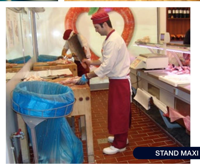
The Longopac system is available in a variety of designs to suit different purposes. There are ready-made solutions with stands to be used in kitchens for instance, cabinets with cassette holders and waste bins. The Longopac system is flexible and can be built into existing cabinets and behind sorting walls. Paxxo also offers metal detectable solutions for environments that require it.