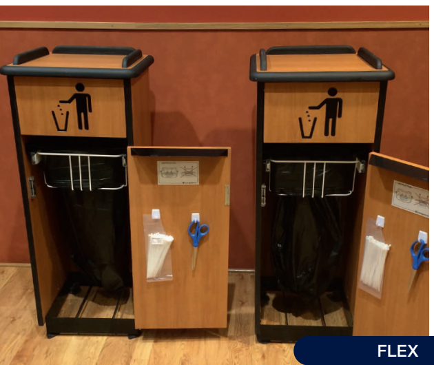
The Longopac system is available in a variety of designs to suit different purposes. There are ready-made solutions with stands to be used in kitchens for instance, cabinets with cassette holders and waste bins. The Longopac system is flexible and can be built into existing cabinets and behind sorting walls. Paxxo also offers metal detectable solutions for environments that require it.