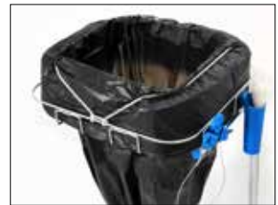
Rubber band Item no. 3102 This accessory can be used together with all Longopac cassette holders. Effectively locks the cassette in place and prevents it from unravelling.