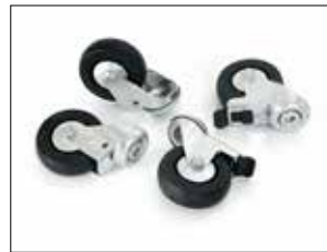
Stand Dynamic ESD Kit Wheels Item no. 34616 Contains four castor wheels, two of them with brakes. Replaces the original wheels on stands used in ESD restricted areas.