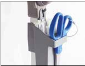
Cable-tie holder for Longopac Stand Classic Std grey. Item no. 30410 Metal-detectable, blue. Item no. 30416 The cable-tie holder is suitable for both Maxi and Mini, and available in two versions.