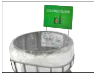
Sign holder for Longopac Stand Classic & Dynamic For item no. see charts on Stands and Dynamic. Signs are available in A4Portrait or A5Landscape.