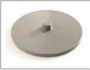
Lid for Longopac Stand Classic Maxi and Mini Mini Item no. 31140 Maxi. Item no. 30140