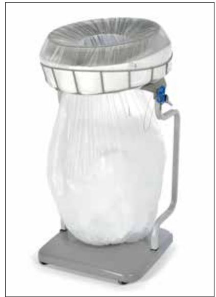
Stand Classic Recycling