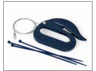
Safety kit Cutter blue kit Item no. 30440 Contains cutter, metal de-detectable PP. Wire in stainless steel and cable ties, metal detectable PA