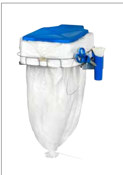
Mini Flex with lid

Two new products have been added below. Mini Flex with a lid and the first Midi version. Wall-mounted solutions are ideal for areas with limited space and where hygiene is important. They also facilitate cleaning.