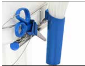
Cable-tie holder for Longopac Stand Dynamic Item no. 30410 (only holder) The cable-tie holder for the Dynamic range is suitable for Mini, Midi and Maxi Dynamic.