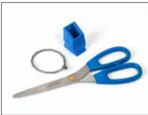
Scissors kit for Longopac Stand Dynamic, metal-detectable Item no. 34609 Kit containing metal-detectable scissors, scissors holder, stainless steel wire.