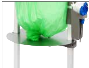
Adjustable plate for Stand Classic Mini Item no. 31480 Reduces the consumption of bag material and reduces the size of the bag. Primarily intended for use with sticky, heavy waste. Can be used for Bio bag cassettes.