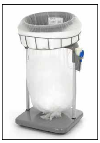
Stand Classic Maxi/Maxi Food