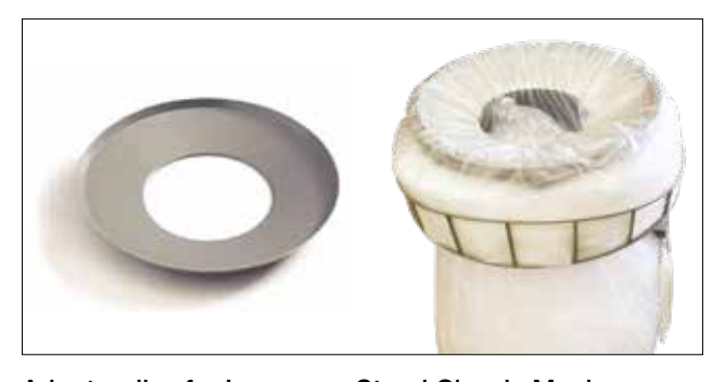
Adapter disc for Longopac Stand Classic Maxi Item no. 30170

Reduces the aperture for easier compression of e.g. recycled plastic. Only available for Maxi.