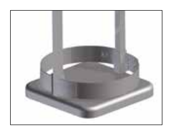
Frame for Longopac Stand Classic Maxi Item no. 33900 The frame holds the bag in place.