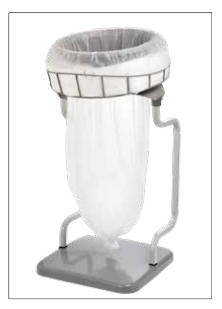
Stand Classic Recycling