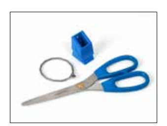
Scissors kit for Longopac Stand Dynamic, metal-detectable Item no. 34609 Kit containing metaldetectable scissors, scissors holder, stainless steel wire.