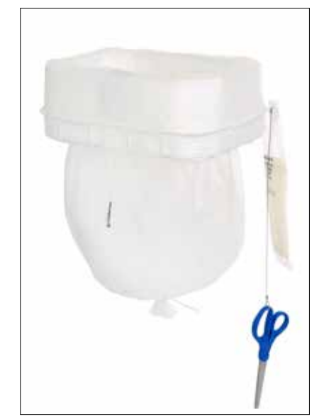
Maxi Wall Mini Wall Mini Flex