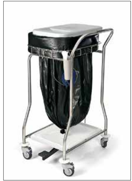
Stand Dynamic UBS