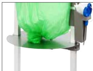
Adjustable plate for Stand Classic Mini Item no. 31480 Reduces the consumption of bag material and reduces the size of the bag. Primarily intended for use with sticky, heavy waste. Can be used for Bio bag cassettes.