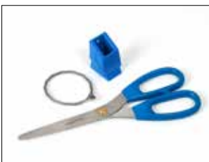
Scissors kit for Longopac Stand Dynamic, metal-detectable Item no. 34609 Kit containing metal-detectable scissors, scissors holder, stainless steel wire.