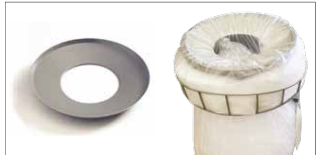
Adapter disc for Longopac Stand Classic Maxi Item no. 30170 Reduces the aperture for easier compression of e.g. recycled plastic. Only available for Maxi.