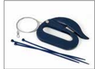
Safety knife - Cutter kit Blue. Item no. 30440 Kit with cutter in metal detectable PP. Wire in stainless steel and cable ties in metal detectable PA