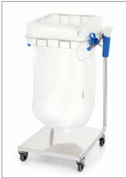
Dynamic Midi/Midi Pedal