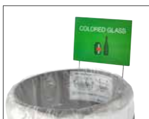
Sign holder for Classic & Dynamic See charts for item numbers. Signs are available in A4Portrait or A5Landscape.