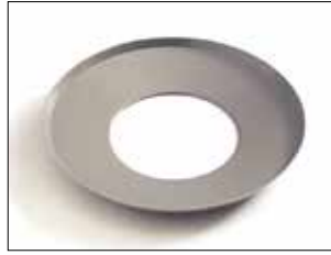
Adapter disc for Classic Maxi Item no. 30170 Reduces the aperture for easier compression of e.g. recycled plastic.