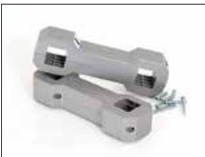
Connector for Classic Item no. 33750 Connects two or more stand products simply and securely. It is also possible to connect Maxi with Mini.