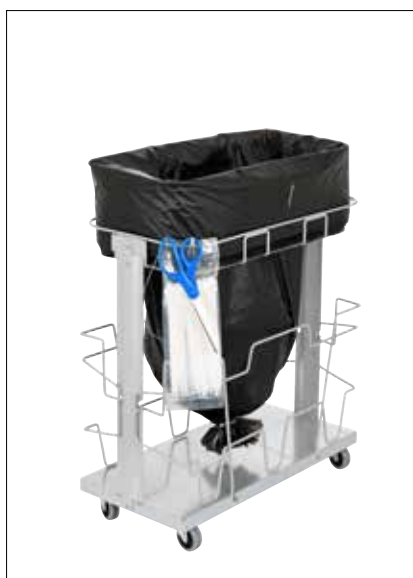
Dynamic Midi UBS