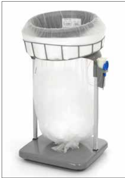
Classic Maxi/Maxi Food