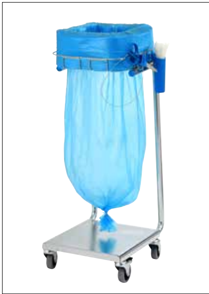
Dynamic Mini/Mini Pedal