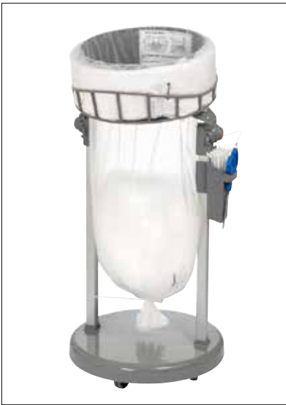
Classic Mini/Mini Food