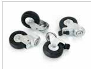
Dynamic ESD Kit Wheels Item no. 34616 Contains four castor wheels, two of them with brakes. Replaces the original wheels on stands used in ESD restricted areas.