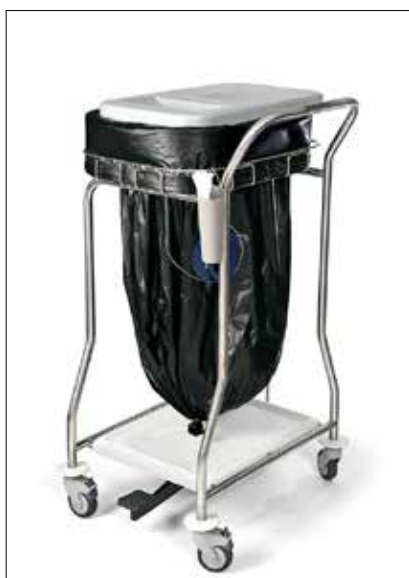
Dynamic Midi Nouvo Pedal