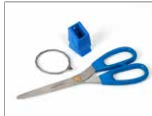
Scissors kit for Dynamic Metal detectable Item no. 34609 Kit with metal detectable scissors, scissor holder and stainless steel wire.