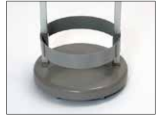
Frame for Classic Mini Item no. 33890 The frame holds the bag in place.