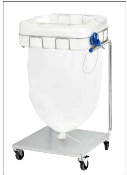
Dynamic Maxi/Maxi Pedal