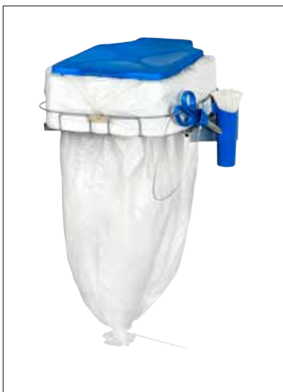
Dynamic Mini with lid

Dynamic Mini with lid and the Midi versions are wall-mounted solutions. These are ideal for areas with limited space and where hygiene is important as they facilitate cleaning.