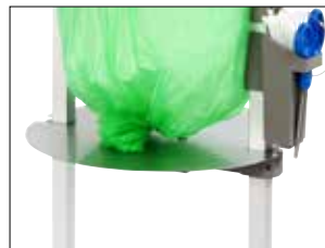
Adjustable plate for Classic Mini Item no. 31480 Reduces the consumption of bag material and the size of the bag. Primarily intended for use with heavy waste. The Bio bag cassettes can with advantage be used.