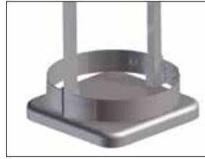
Frame for Classic Maxi Item no. 33900 The frame holds the bag in place.