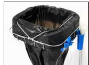
Rubber band Item no. 3102 The rubber band can be used together with all Longopac cassette holders. Effectively locks the cassette in place and prevents it from unravelling.